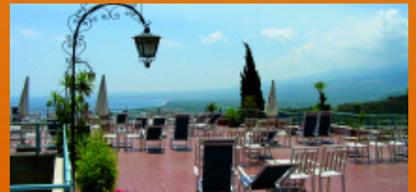
Terrace at Hotel Continental

Located in the heart of Naples' historic district, the Palazzo Caracciolo is a welcome retreat from the bustle of the city. Relax poolside or sample local specialties at the hotel's restaurant. Each guest room offers a hair dryer, telephone, climate control, minibar and television.