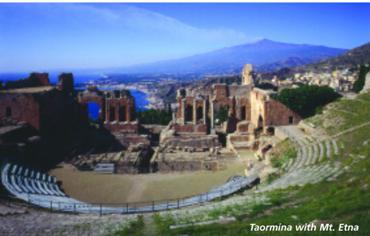
Taormina with Mt. Etna