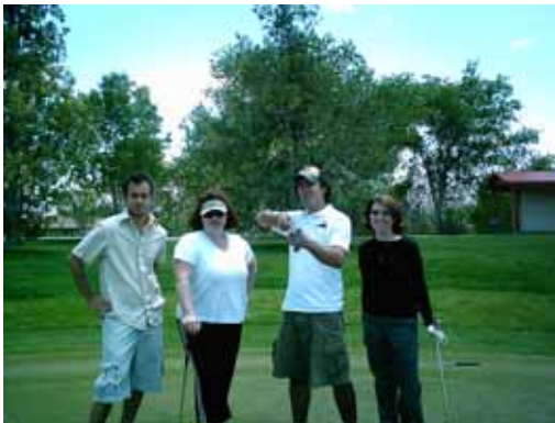
3rd Place 2006– Student team (seniors):