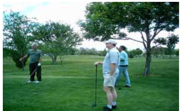
2nd Place 2006– Professor team: Flunk and Forget